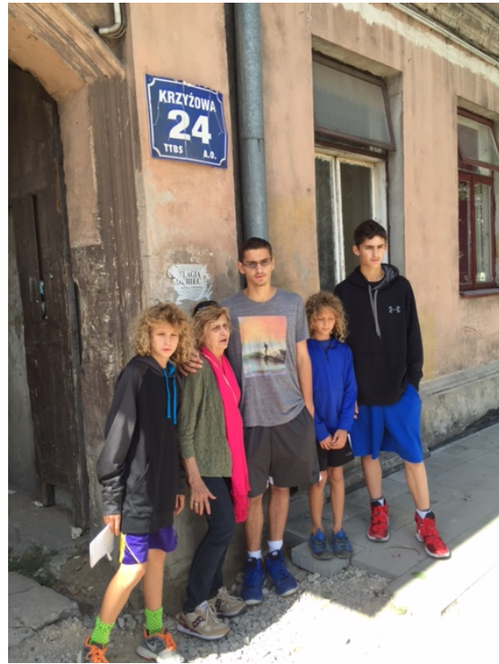
In front of the apartment in the Ghetto where my great grandparents were shot