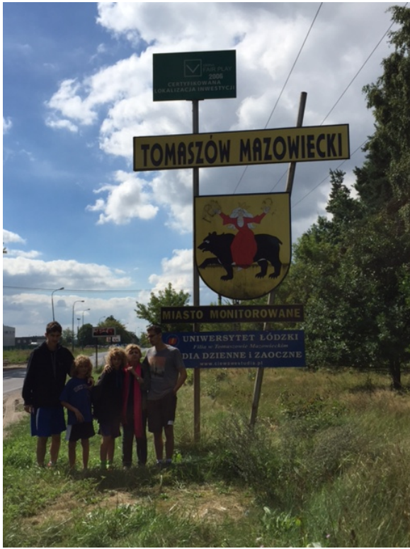
In front of the sign to the town