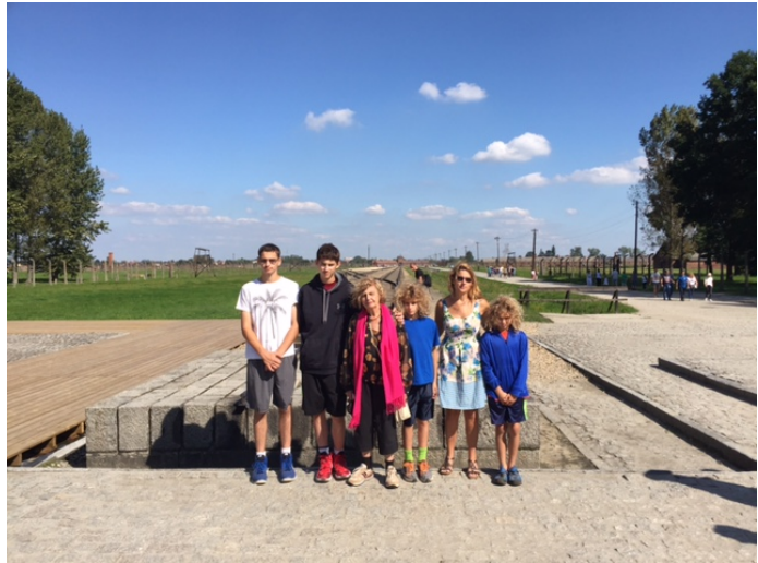
By the memorial in Auschwitz with the camp behind us (you can see the entrance in the far distance)