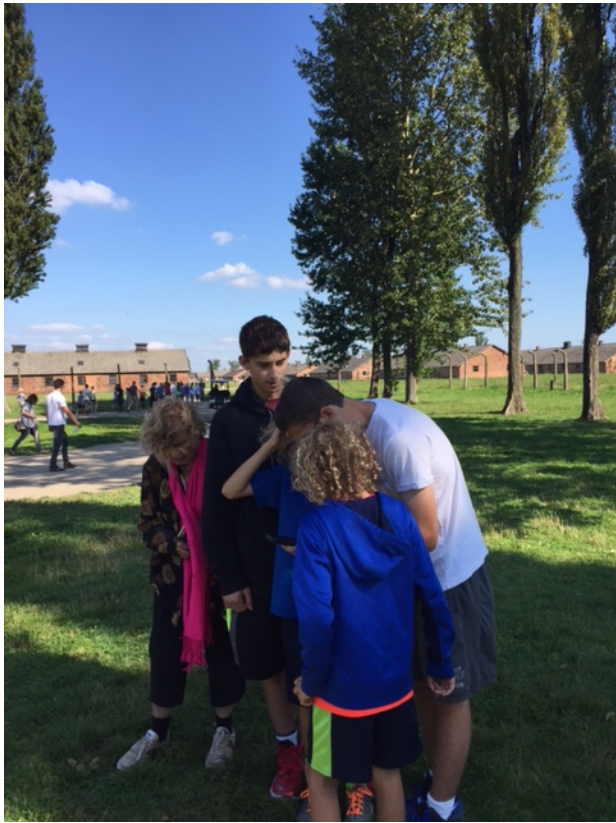
Saying Kaddish at the site with ashes from crematoriums