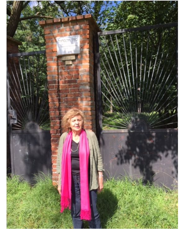
In front of the locked cemetery