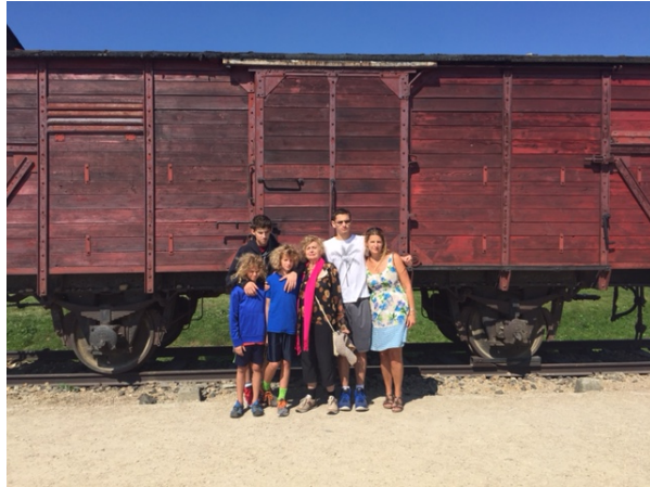
In front of the cattle car similar to the one that Tova came into Auschwitz (as mentioned in her book)