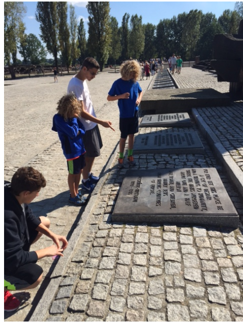
At the Auschwitz memorial