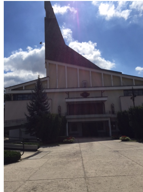
(renovated) church and courtyard where the selections were made