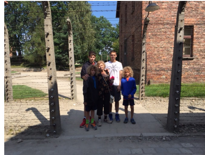
At the fence in Auschwitz I (the master camp)- not where Tova was encamped