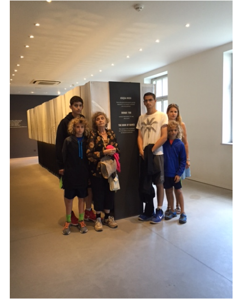
In front of the memorial book listing all the names of the camp victims.