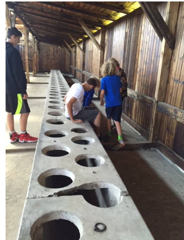
They let the kids go "behind the scenes" to experience what it was like to sit on these 'toilets' where my mom fell in as a small child